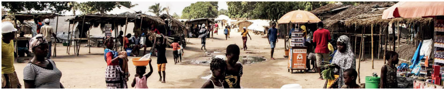
RESPONSE TO VIOLENT EXTREMISM IN CABO DELGADO FROM A TRIPLE NEXUS PERSPECTIVE: HUMANITARIAN, DEVELOPMENT AND PEACE