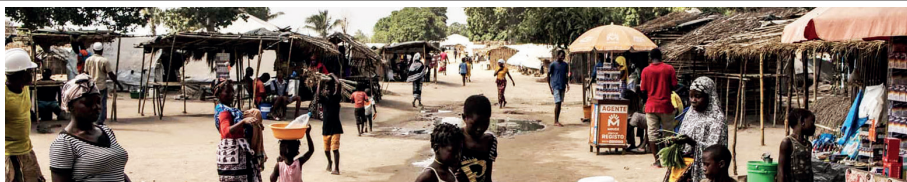
RESPONSE TO VIOLENT EXTREMISM IN CABO DELGADO FROM A TRIPLE NEXUS PERSPECTIVE: HUMANITARIAN, DEVELOPMENT AND PEACE